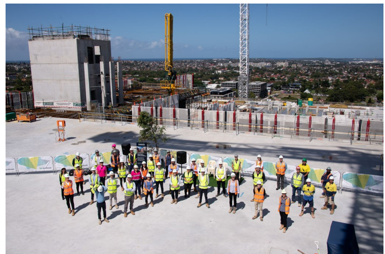
Pictured above: The front of the ASB as pictured in Nov 2021; the Topping Out ceremony in March 2021