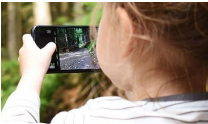
Pictured below: Photo Finish competition entries & descriptions

The competition closes on 14 November 2021 . For more information, please visit the SCHN website .