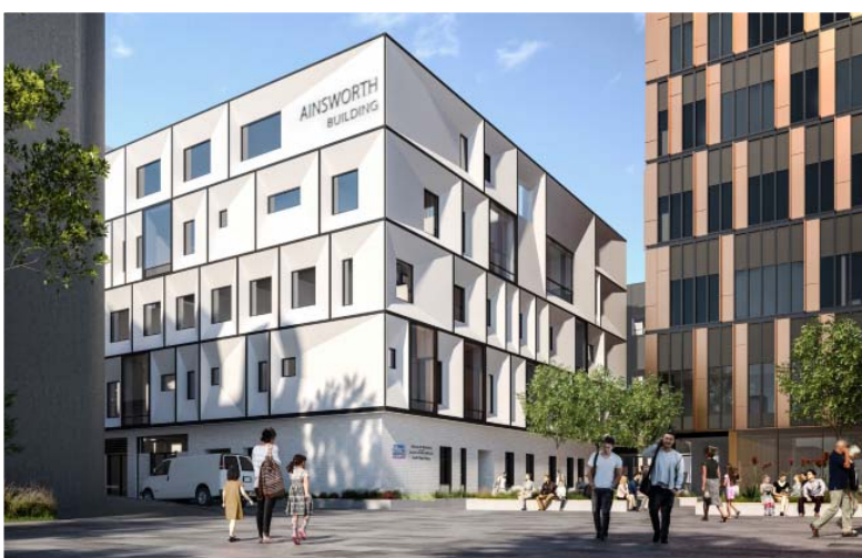
Artist's impression—raised pedestrian zone and IASB

To ensure operational continuity of the Randwick Hospitals Campus, the works on Hospital Road will be delivered in multiple stages over 18 months from December 2019 and planned in close consultation with key stakeholders to manage any potential impacts on patients, staff and residents.