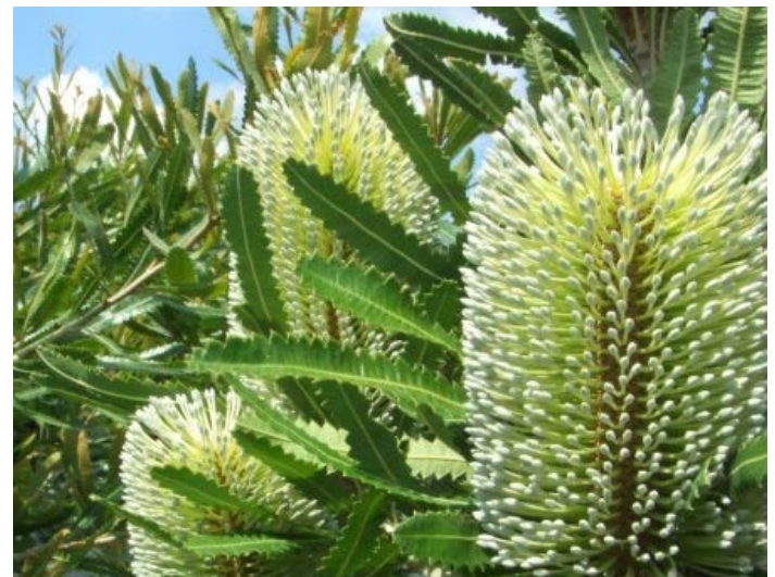
Image: Banksia serrata

This is all part of our long-term commitment to delivering an urban environment that is green and healthy across the whole Precinct.