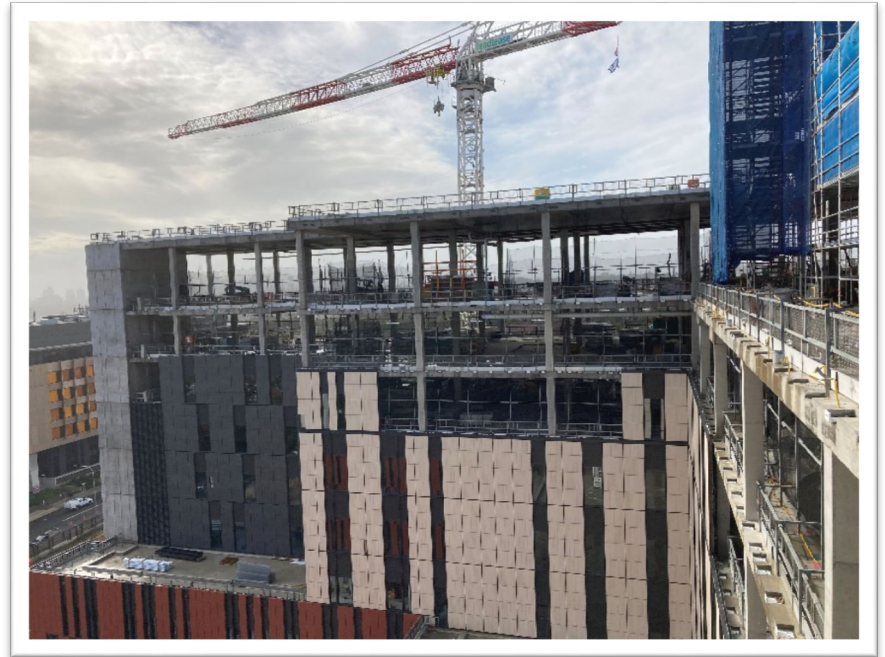
Façade installation progressing on the IASB