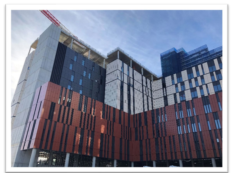
View of the IASB construction site

Cabling and pipe works to connect communications infrastructure around the campus.