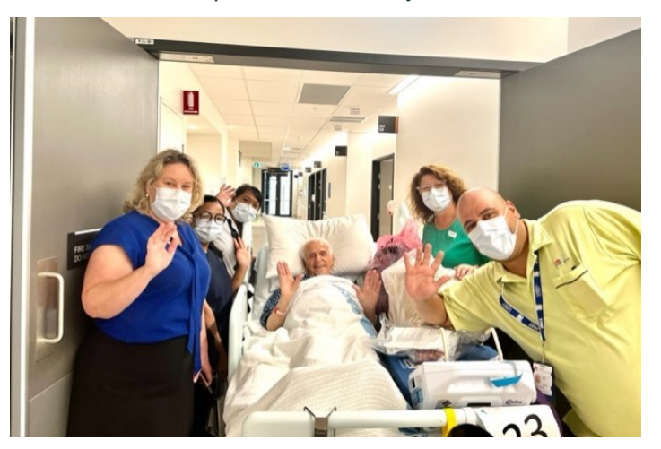
Pictured: Aged Care Rehab & Acute Aged Care Extension said goodbye to their old wards and welcomed their first patient on Wednesday 22 March