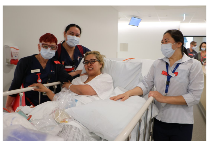
Pictured: Clinical Neurosciences opened their new ward and welcomed their first patient on Tuesday 28 March