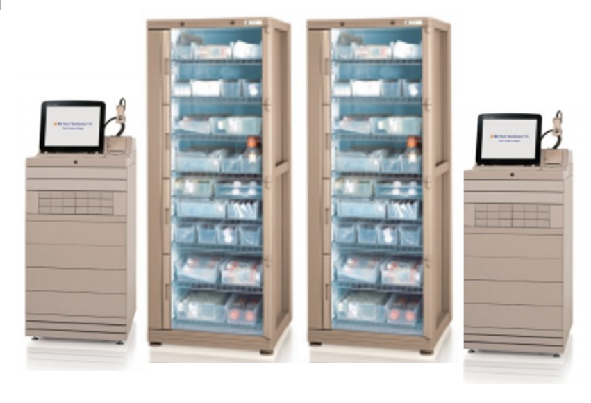
Pictured: An illustration of the Automatic Dispensing Cabinet

Training will be provided for all affected staff on how to operate the ADCs in their ward or department. Stay tuned!