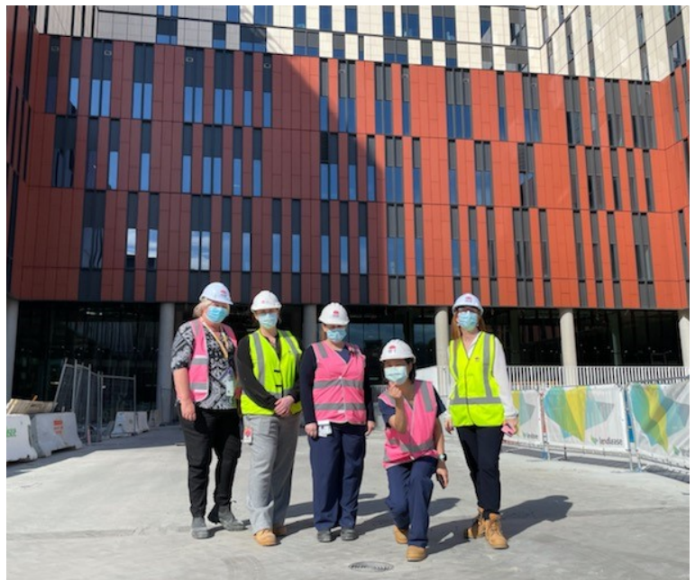
Pictured: Staff on a site tour of the new ED fitout