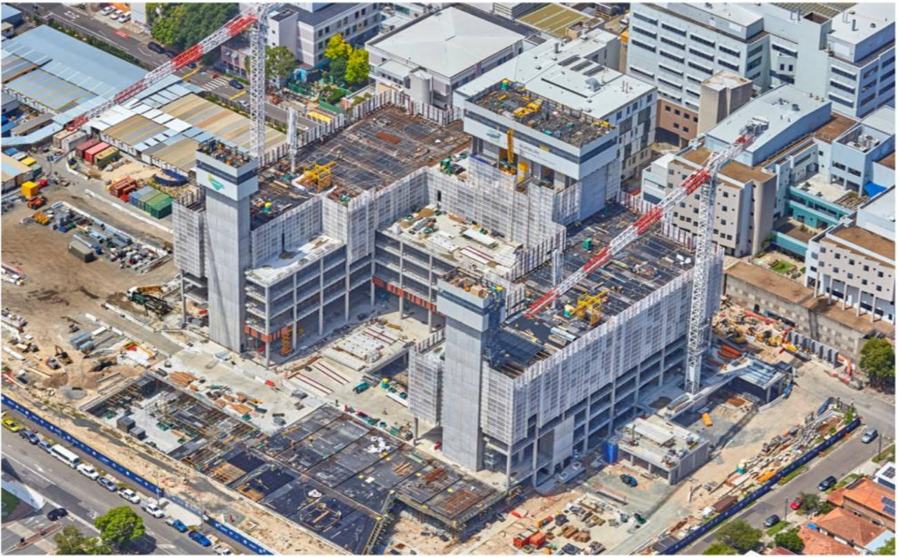
Construction activity on the site of the Randwick Campus Redevelopment