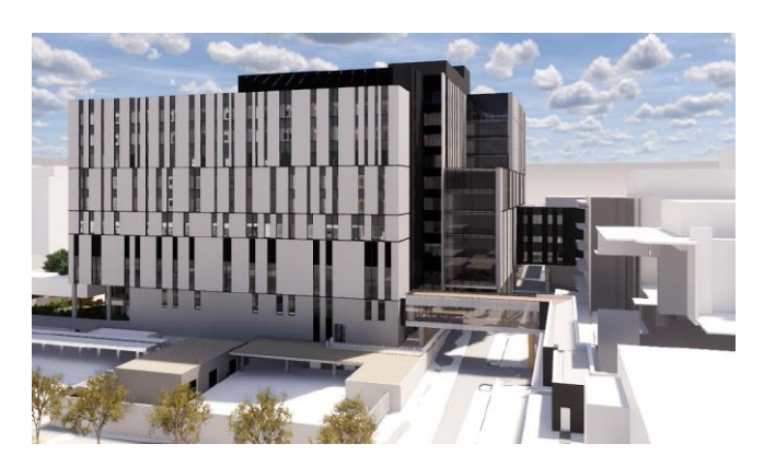
Artists impression of the Integrated Acute Services Building looking north

This investment complements the NSW Government's $720 million investment in a new Acute Services Building for the Prince of Wales Hospital that is under construction and will open in 2022.