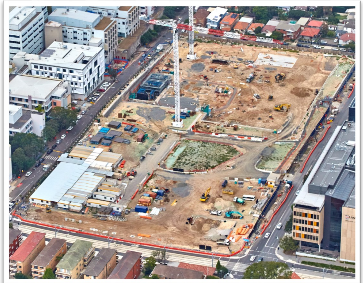
Randwick Campus Redevelopment Site December, 2019

The Integrated Acute Services Building will reach its full height in early 2021.