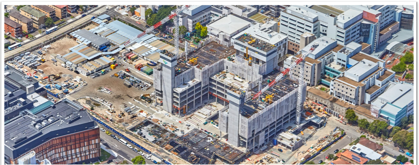
Randwick Campus Redevelopment Site December, 2020