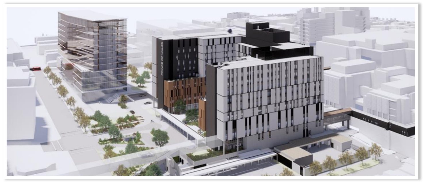
Artist's Impression of the Acute Services Building, view from Botany Street. Opening 2022

The NSW Government is investing $720m to deliver a new Acute Services Building for Prince of Wales Hospital. The first stage is a catalyst project to deliver on the vision of building a world-class health, research and education precinct delivering cutting-edge, compassionate and holistic healthcare and wellness programs to the local community and other residents of NSW.