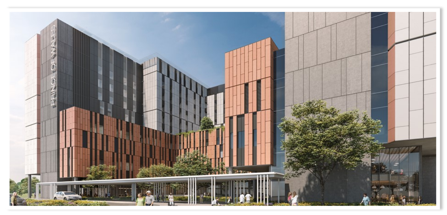
Integrated Acute Services Building, view from Botany Street. Opening 2022.

The NSW Government is partnering with UNSW Sydney to deliver the Integrated Acute Services Building (ASB); the first stage of the Randwick Campus Redevelopment and the catalyst project for expanding the world-class health, research and education facilities at the Randwick precinct.