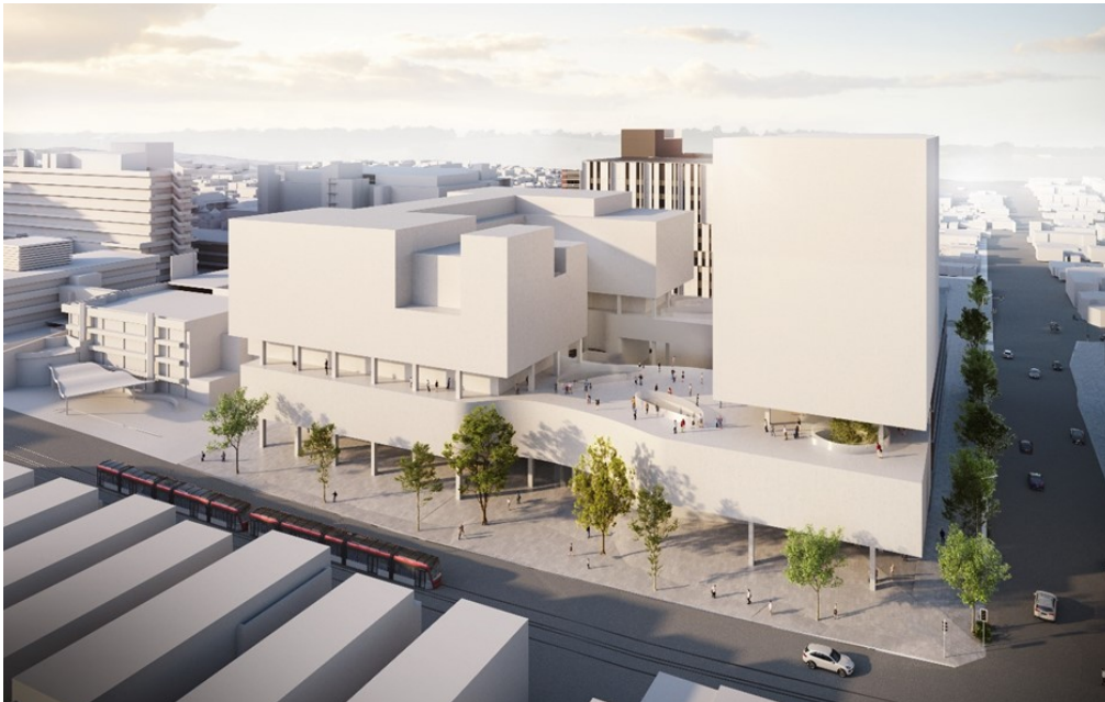
Artist's impression of an early concept for Sydney Children's Hospital, Randwick Stage 1 including Comprehensive Children's Cancer Centre and UNSW's Health Translation Hub

The NSW and Federal Governments have announced $608 million to deliver brand new, state-of-the-art paediatric health and medical research facilities as part of the first stage of redeveloping Sydney Children's Hospital, Randwick. The redevelopment will include Australia's first Comprehensive Children's Cancer Centre and brings world-leading clinical care, research and teaching together to deliver improved models of care for sick and injured children. This is the next exciting phase of the broader Randwick Campus Redevelopment.