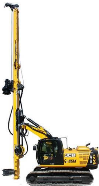
Two piling rigs will be used to install retention piles in the location of the new Acute Services Building.

From May 2019 the next phase of preparatory activities for the Acute Services Building will commence.