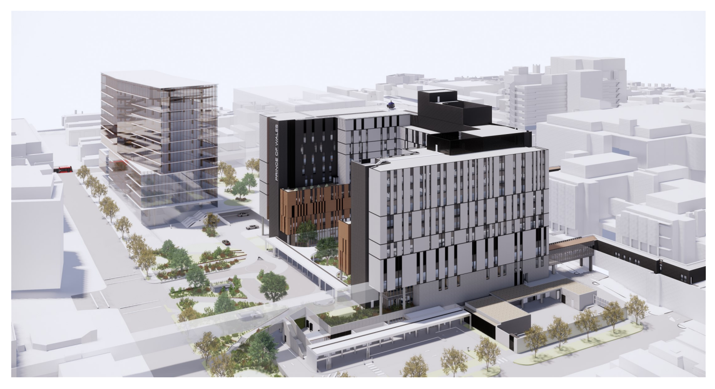
Artist's Impression of the Acute Services Building, view from Botany Street. Opening 2022

Community Transport and Car Parking Factsheet - February 2019