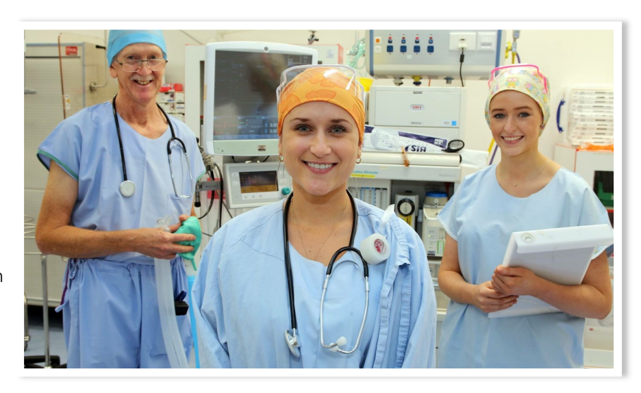
Prince of Wales Hospital Staff

Health and urban master planning are important for considering the new hospital in the context of the broader community, so that the needs of our changing city can be accommodated now and into the future.