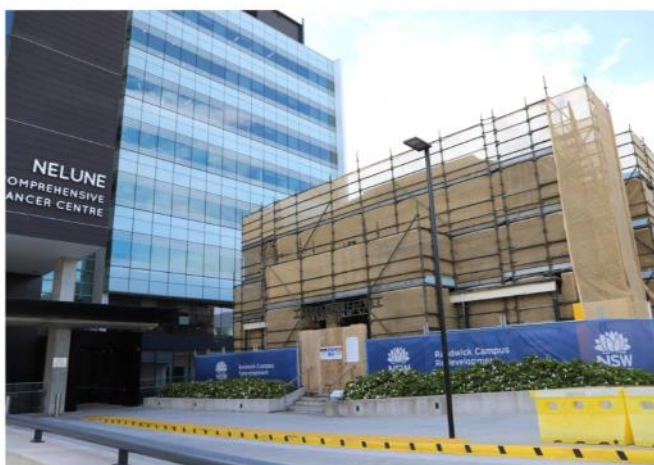
Superintendent's Cottage with shade cloth covering the building while the restoration works are undertaken

Refurbishment of the cottage includes façade restoration and replacement works to the sandstone verandas, roofs, services upgrades and internal refurbishments including new bathrooms on both levels and the installation of a lift. Works are expected to be completed by mid 2019.