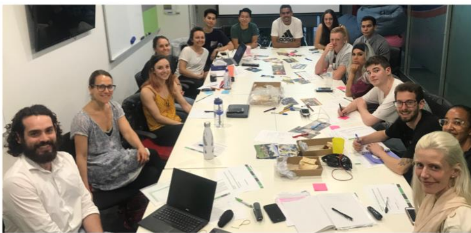
Participants at the youth session at Headspace, Bondi Junction

There is an ambitious vision for a strengthened precinct, which includes the Randwick Hospitals Campus and UNSW Sydney as well as other partner universities, Randwick City Council and the Greater Sydney Commission.