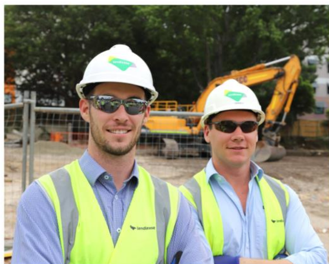
Workers from Lendlease on site

The construction site will close on Friday 21 December and re-open Wednesday 2 January 2019. There will be no activity on site during the closure. Additional security patrols will be in place providing 24/7 monitoring of the site.