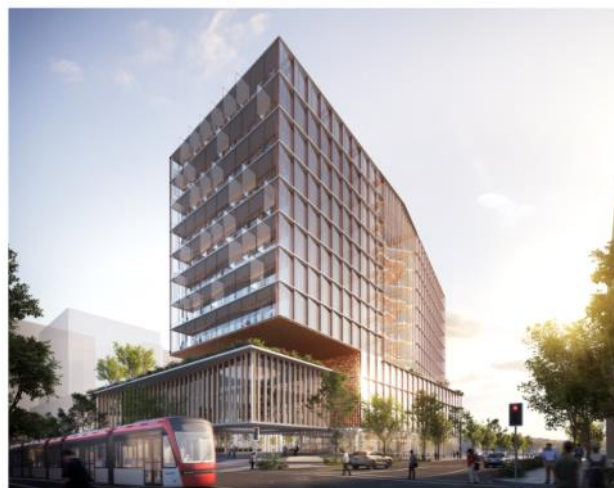
Artists impression of the Health Translation Hub

The Health Translation Hub is expected to open in 2025 and is part of a broader $500 million commitment to the precinct by UNSW over the next decade. This investment complements the NSW Government's $720 million investment to deliver a new Acute Services Building and strengthen the Randwick Health and Education Precinct.