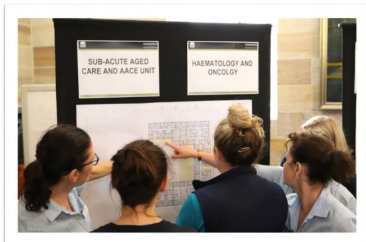
Staff from Prince of Wales Hospital viewing the detailed design plans of the new Acute Services Building

Almost 200 project user group meetings have been held, with over 20,000 items of furniture, fittings and equipment and major medical equipment modelled and specified. Consumer and community engagement has played an important role in the design process, and consumer representatives joined project user group leads to talk to staff about the floor plans.