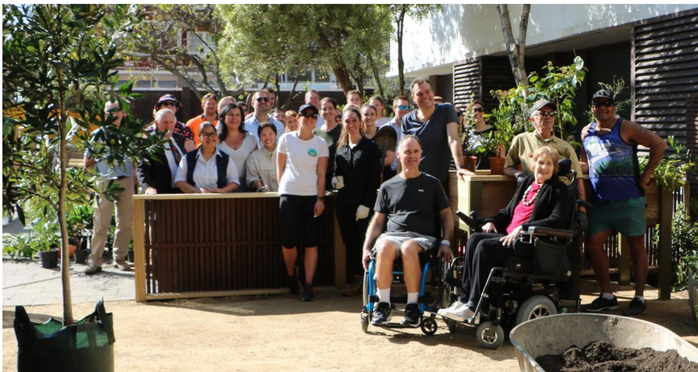
Community Garden working bee