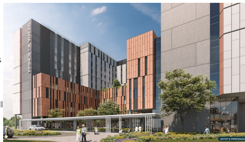
Artist's Impression of the Acute Services Building, view from Botany Street. Opening 2022

Piling and bulk excavation will commence in early 2019 enabling construction of the Acute Services Building to commence in mid-2019.