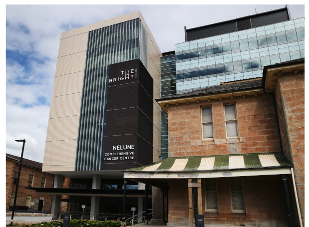
Medical Superintendent's Cottage and the Nelune Comprehensive Cancer Centre of Prince of Wales Hospital