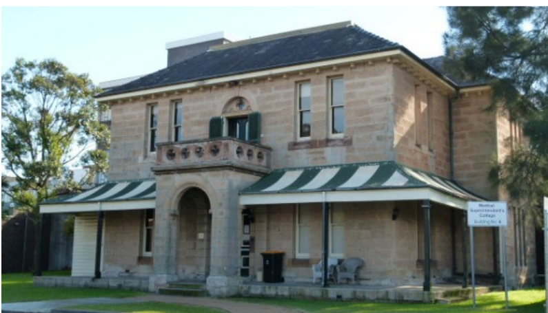
Medical Superintendent's Cottage located near Prince of Wales Hospital High Street Entrance

The Centre will be a sanctuary and support for cancer survivors. Together with the adjacent Nelune Comprehensive Cancer Centre of Prince of Wales Hospital, which provides cancer care in an acute setting, the two facilities will be complementary in the provision of whole-of-person cancer care.