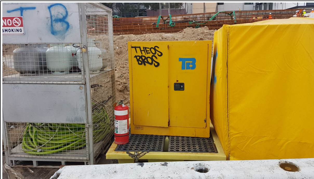
Bunding at chemical store