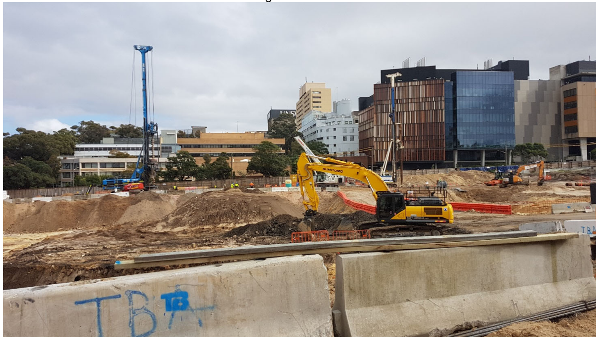
Piling in operation (blue rig in background)