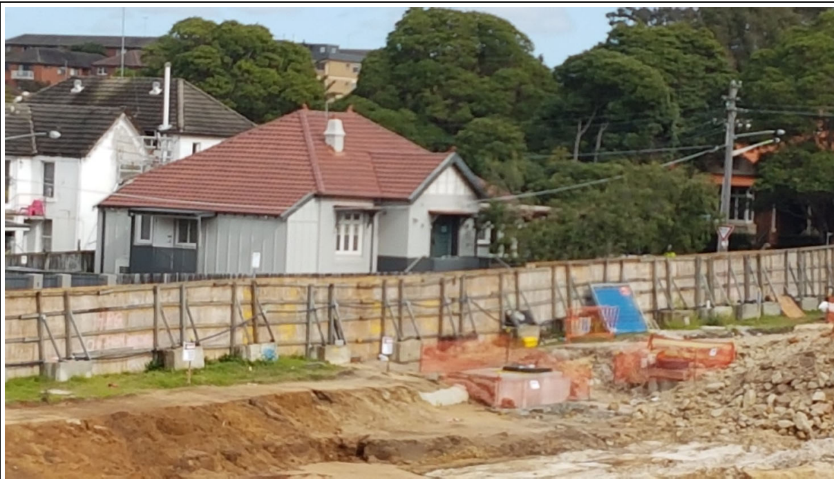
Hoarding along Magill Street