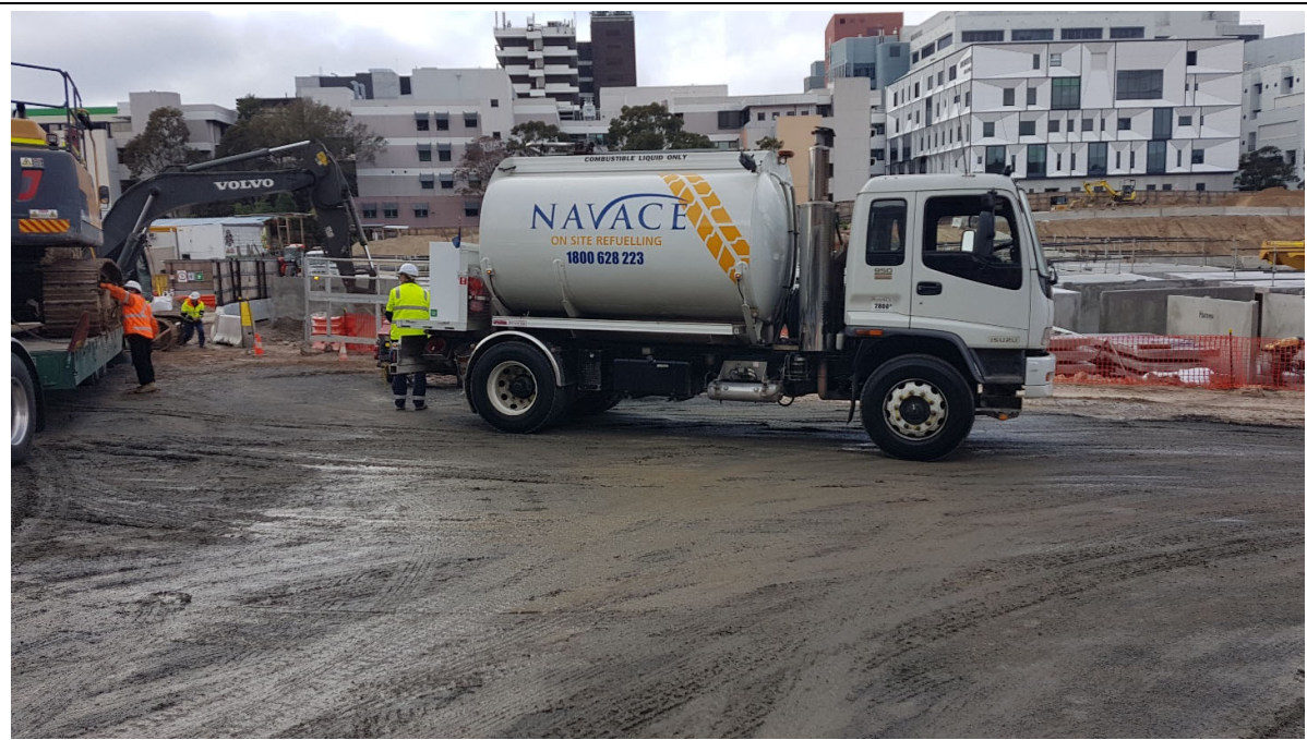
On site refuelling truck (not refuelling at time)