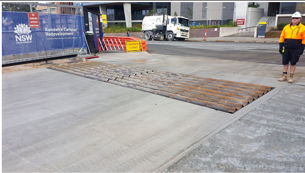
Rumble grid at Gate 01