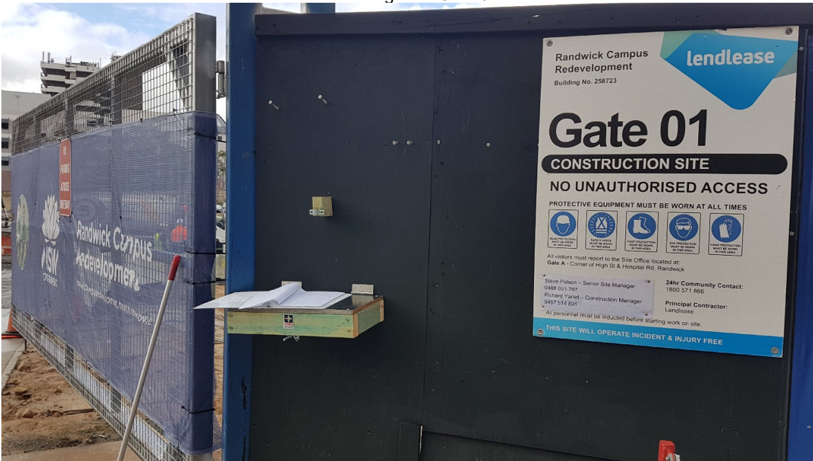
Sign on hoarding at Gate 01.