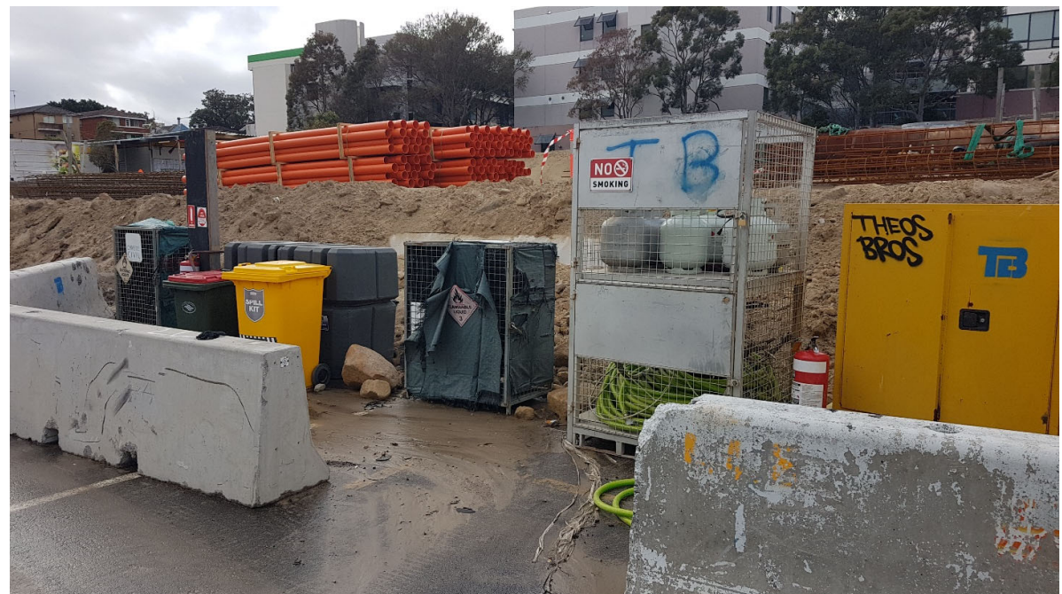
Hazardous goods storage area with spill kit