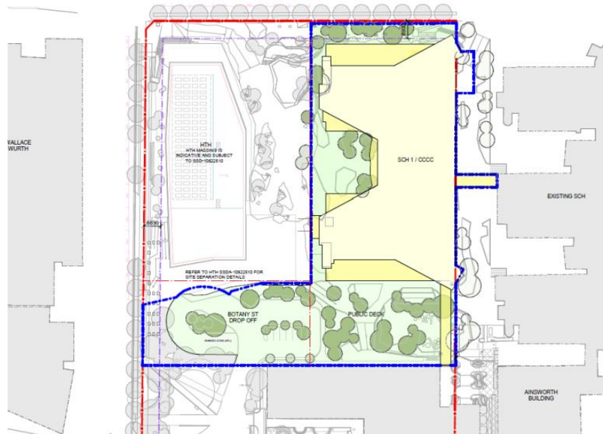
Figure 1 SSD10831778 Site Boundary