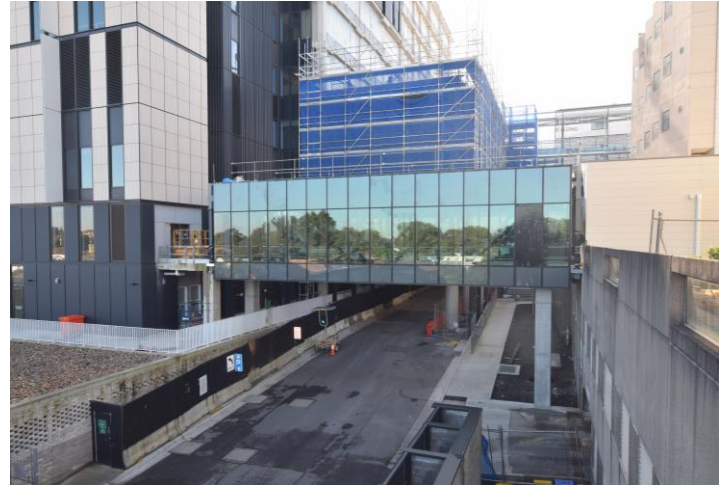
Works progressing for the public link bridge connecting the new Acute Services Building to the hospital campus.

There will be changes to hoarding alignments on Hospital Road north throughout August. Pedestrian access on the existing footpaths will be maintained.