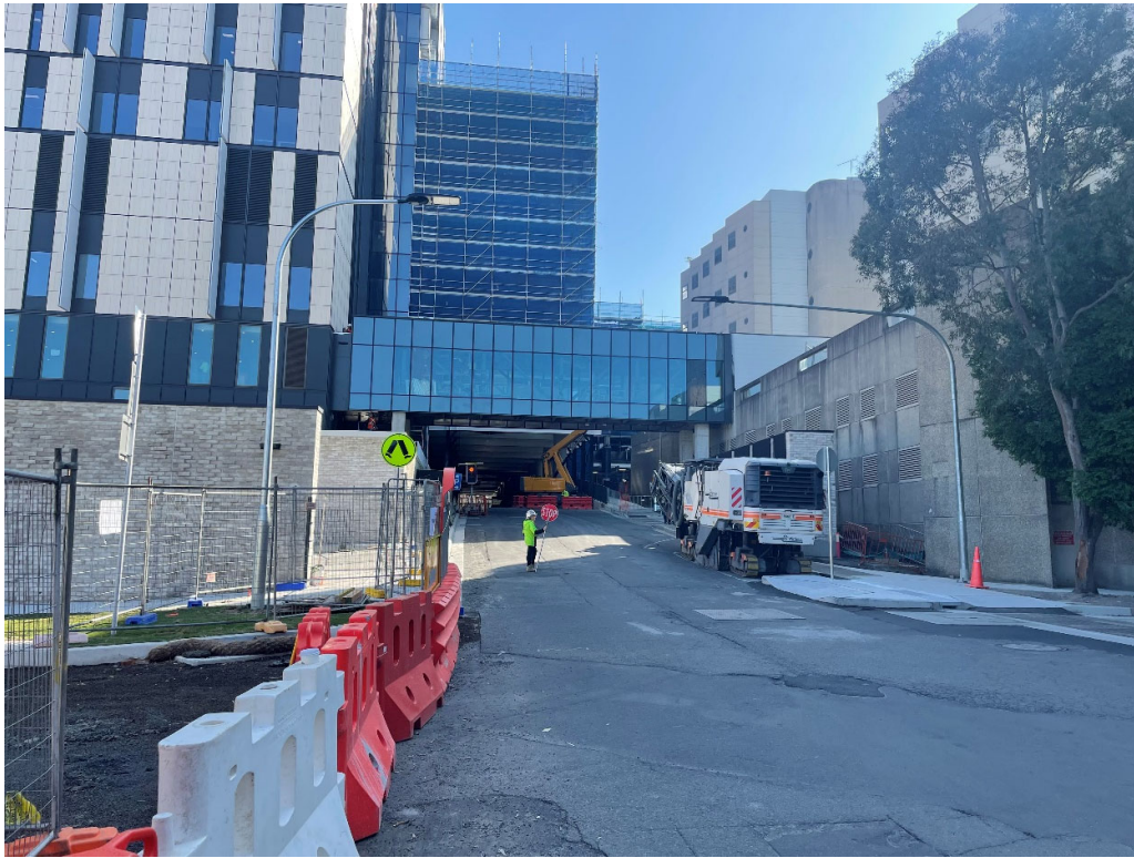
View to north and IASB on Hospital Road