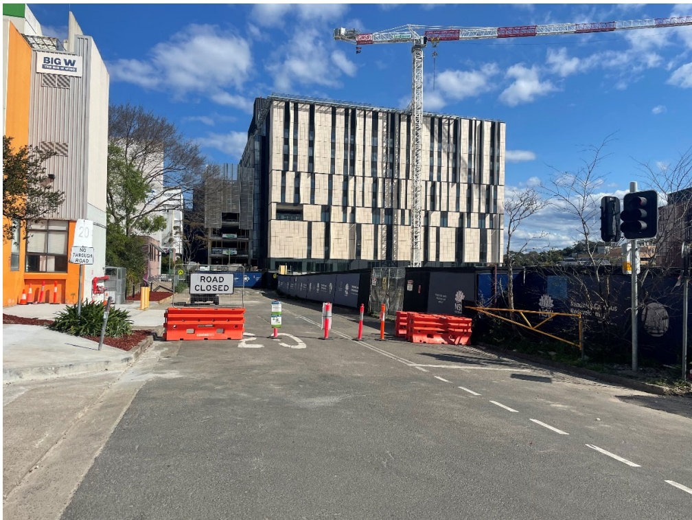
View south to IASB on Hospital Road at High Street intersection