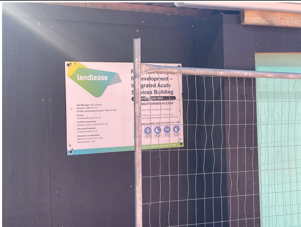
Hoarding and signage obstructed