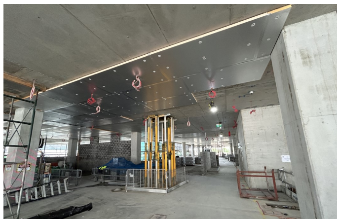
Left: Level 2 construction progress

Starlight Children's Foundation's 'Starlight Room' will be established on this floor and include a performance area, outdoor terrace, kitchen facilities and technology to broadcast directly to the bedside.