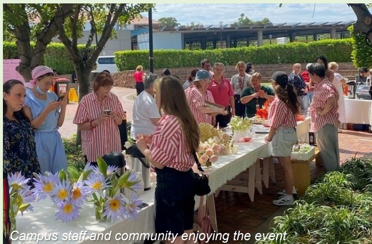
Campus staff and community enjoying the event