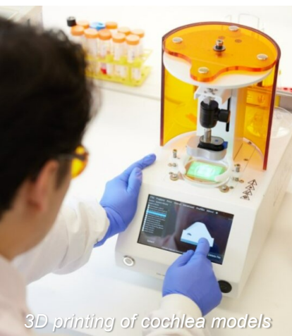
3D printing of cochlea models

The floor will be designed with small and flexible meeting rooms where technologists can work with clinicians to discuss their challenges and pain points, assess them and design solutions.