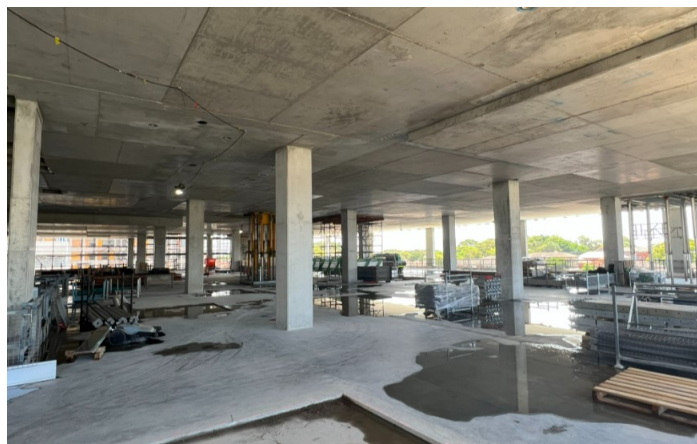
Right: Level 3 construction progress