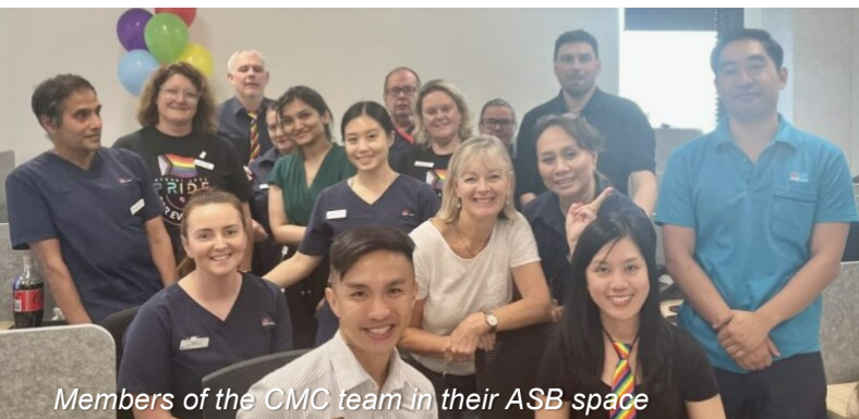
Members of the CMC team in their ASB space

All are enjoying their new home in the ASB!