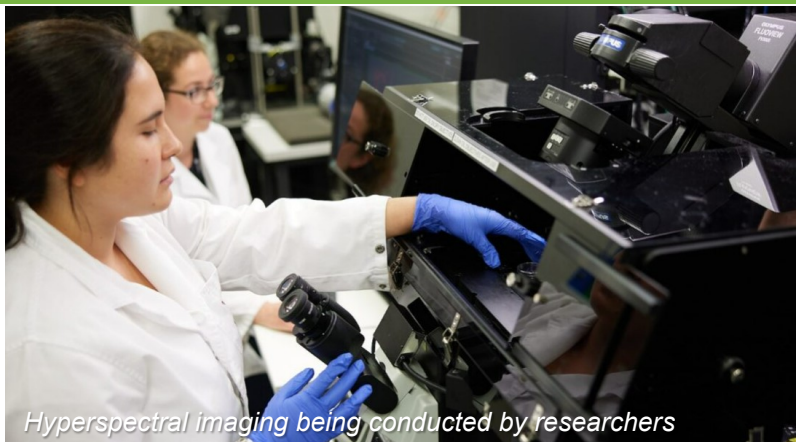
Hyperspectral imaging being conducted by researchers

Being co-located with operating theatres, clinicians will have direct access to explore and innovate solutions, working with researchers on presurgical planning by imaging and then bioprinting physical anatomy, supporting personalised and patient-centric approaches to care.