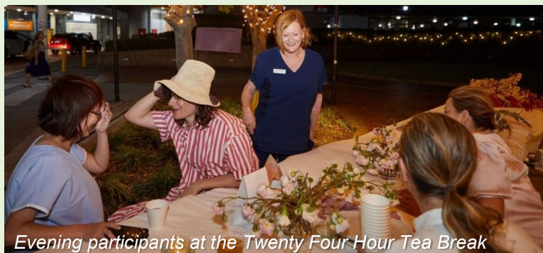
Evening participants at the Twenty Four Hour Tea Break