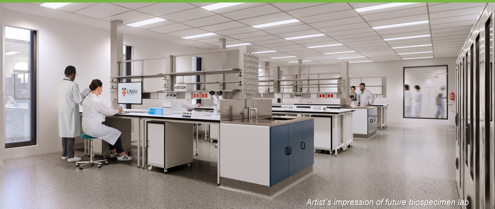
Artist's impression of future biospecimen lab