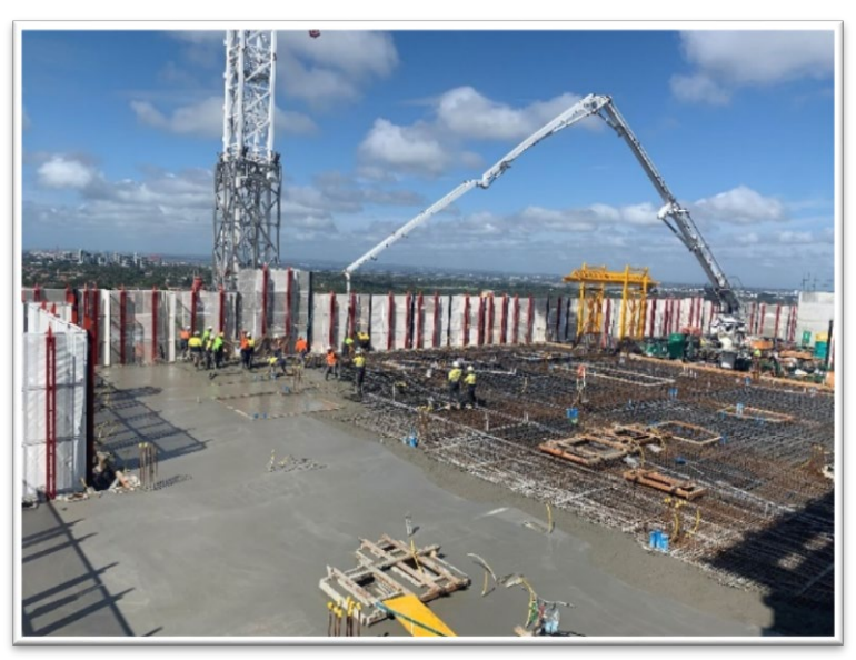
Major concrete pouring activity on the top levels of the IASB